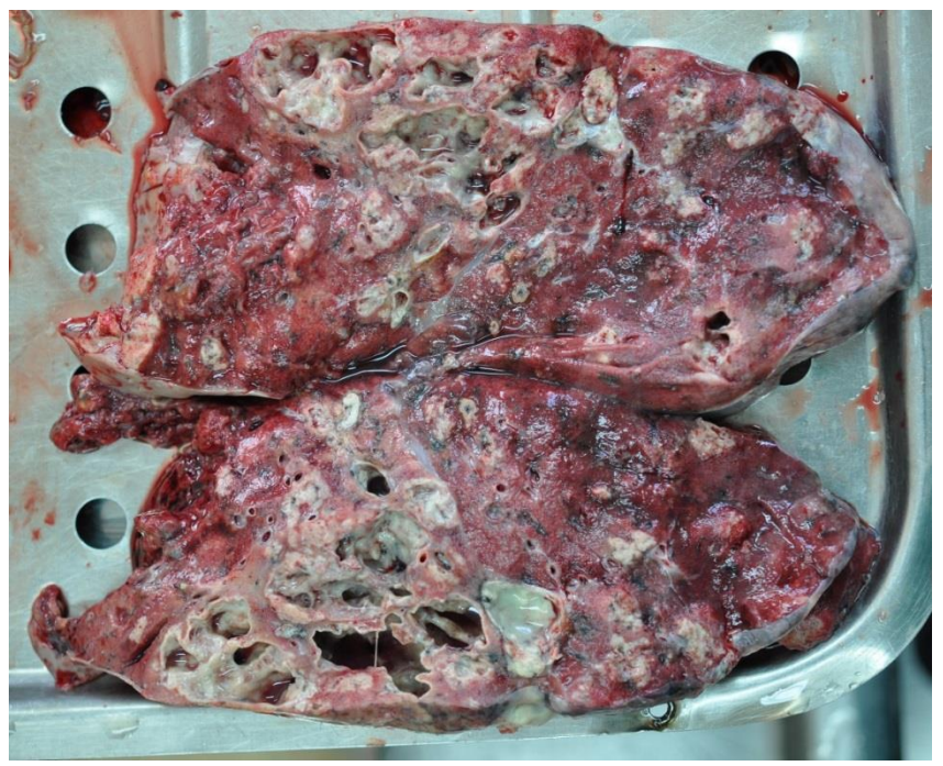
Fig. 1. The left lung at autopsy with damage centers and cavities

Autopsy revealed multiple lung acinar-nodose, polilobular and segmental grayish-whitish foci of necrosis with destruction and the formation of multi-chamber cavities, diameter from 2.0 till 5.0 cm (Fig. 1).