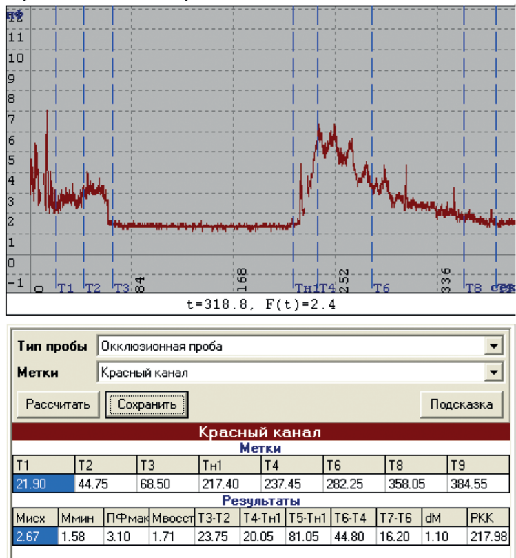
Fig. 1. Occlusal test. Normocirculatory hemodynamic type of microcirculation

In wavelet analysis, the following components were identified: