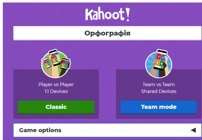
Figure 4. Quiz «Orthography»

teams, using any mobile device connected to the Internet (Fig. 4.). The time for their implementation is set by the teacher. At the end of the game, students can observe the rating of the competition, determine the winner, and discuss issues where mistakes are made.