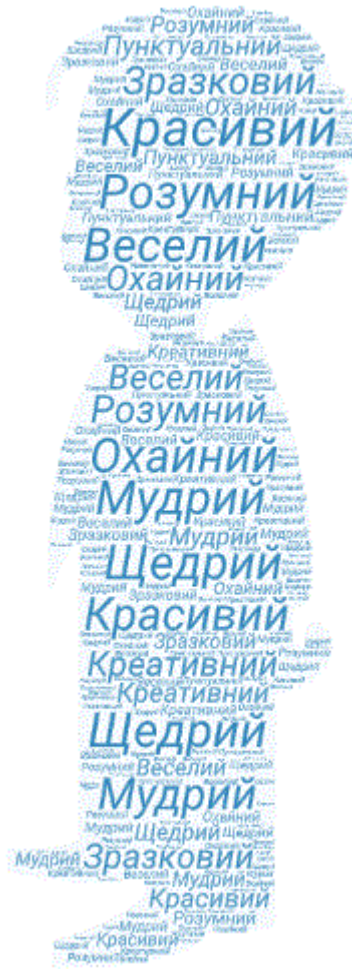
Figure 2. A cloud of words for learning adjectives denoting human traits

- Loupe - a service designed to create image collages. When learning the language, "collage - is seen as a visual aid, a methodical technique that involves a consistent extension of the lexical background of a key concept and thus creates a visual and content-schematic image of the concept under consideration" (Lutsenko, 2018) You can use image collages when studying any topic. For example, when studying the theme "Vegetables and Fruits" the poster contains images of the most popular products, and the teacher shows and pronounces their name, students repeat. Subsequently, it is suggested to answer the question "What is a fruit or a vegetable?" or "Name the fruit pictured", "What do you buy at the store?", "What is your favorite vegetable?" etc. During the study of the theme "Family" you can ask students to create collages of photos of their family, and during their demonstration to tell about each of its members by the algorithm: name, date of birth, age, profession, hobby, tell about character traits, etc. Collage services for learning a foreign language are aimed at building vocabulary and developing communication skills. Reception of collage promotes the construction of "visual logical supports, creates prerequisites for the development of abstract thinking, and the skills of students' independent work" (Lutsenko, 2018).