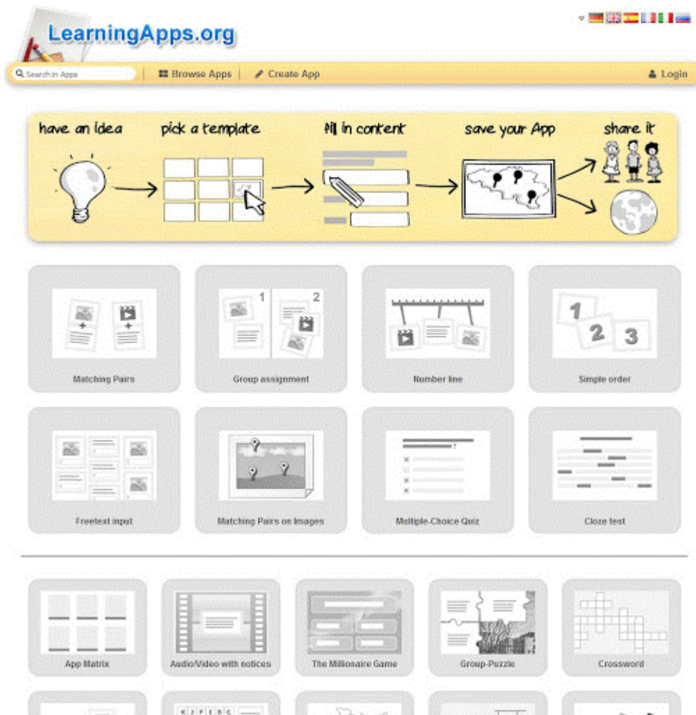
Figure 1. Template for designing exercises

Besides the usual exercises that can be viewed on mobile applications and copyright websites, the service allows you to create tasks using audio, video content, and questions, to perform tasks (such as in the "Horse Racing" format) for both students and students, group grammatical phenomena, and more. Teacher's use of learningapps.org contributes to the rapid, detailed, and deep development of practical skills in the use of knowledge in the form of play.