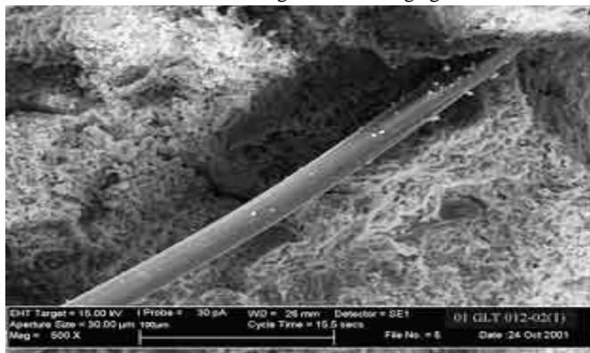
Figure 1. Lack of adhesion of cement stone with polyamide fibers. Electron micrograph [2].

Adhesion of filling agent and cement stone has a determinative influence on physical-mechanical properties of concrete. Adhesion is caused by close attachment and joining of cement stone with the filling agent which is achieved due to a rough surface of the filling agent. The best attachment and joining have the filling agents whose surface lets the concrete get into a filling agent.