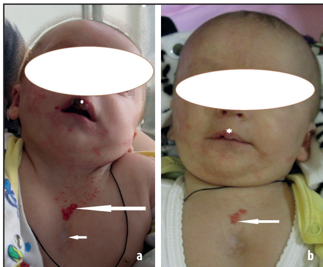
Fig. 2. a-b. Patient with PHACES syndrome, S1,2,3 segmental hemangiomas and hemangioma in sternal region. Picture before treatment, 2 month old (a). Picture after two month prednisolone treatment (b).