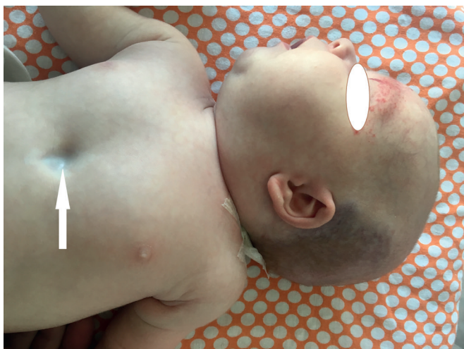
Fig. 1. One month patient with S1 (frontotemporal) right side hemangioma and sternal cleft