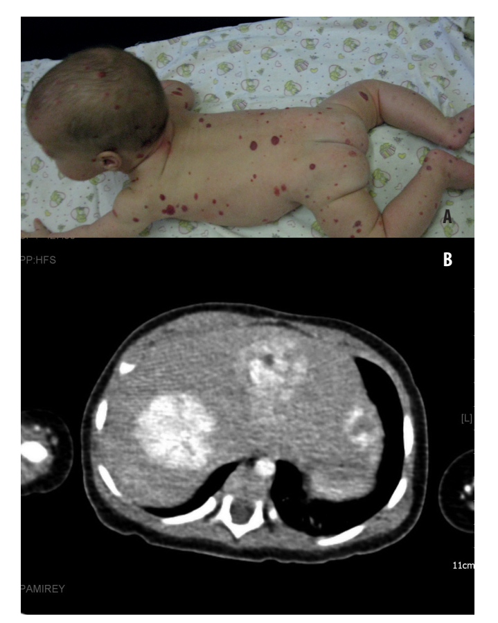
Fig. 2. Representative example of multiple infantile hemangioma. A - Photo, multiple cutaneous lesions. B - axial CT, several hepatic lesions with intervening normal hepatic parenchyma.

it is reasonable to avoid surgical resections or sclerotherapy in children of young age as LMs are typically located near vital organs and anatomical structures and therefore surgical interventions can result into vital functions compromise. [11]. According to the literature data, in about 50% cases, LMs are visible at birth. These data correlate with the results of our study: 53.8% cases of head and neck