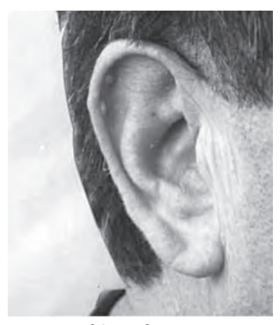
Fig. 2. Gouty tophi on the ear

In patients with chronic gout tophi can be found in multiple locations such as ears (Fig. 2), joints of hands (Fig. 3), feet, ankle, knee, elbow (Fig. 4); less frequently — shoulder, hip, sternoclavicular joints.