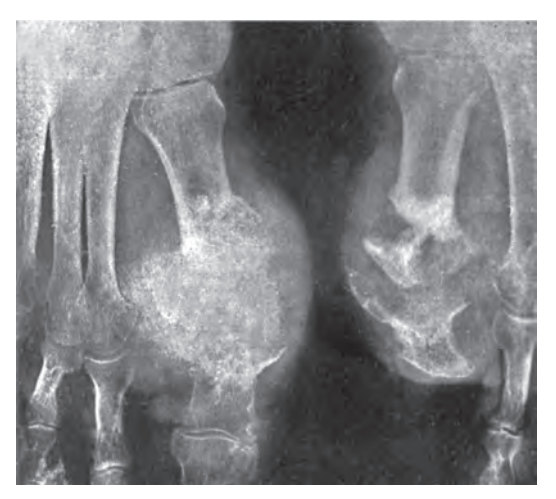
Fig. 5. X-ray. Urate infiltration of tissues around the 1<sup>st</sup> right metatarsophalangeal joint, osteoporosis of the 1<sup>st</sup> left metatarsophalangeal joint, formation of cysts

bone or articular cavity. Secondary osteoarthritis development is accompanied by subchondral osteosclerosis and osteophytosis.