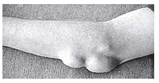
Fig. 4. MSU crystals deposition near the elbow