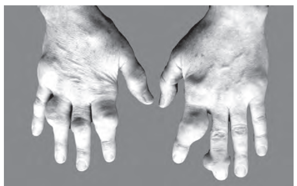
Fig. 3. MSU crystals deposition in the small joints of hand