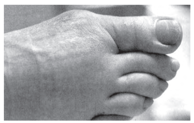
Fig. 1. Acute gouty arthritis of the 1<sup>st</sup> metatarsophalangeal joint

The first acute attack usually marks the onset of intermittent gout. In a lot of patients at early stage of disease attacks occur rarely — once every 1-2 years. Later they gradually become more frequent, long-