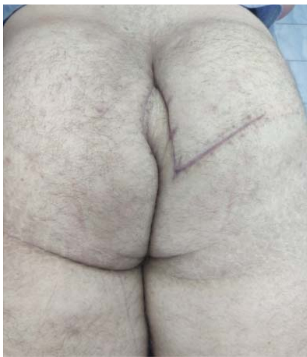
Figure 1. Postoperative scars in the gluteal and sacrococcygeal areas (result of surgical treatment of a recurrent pilonidal cyst)