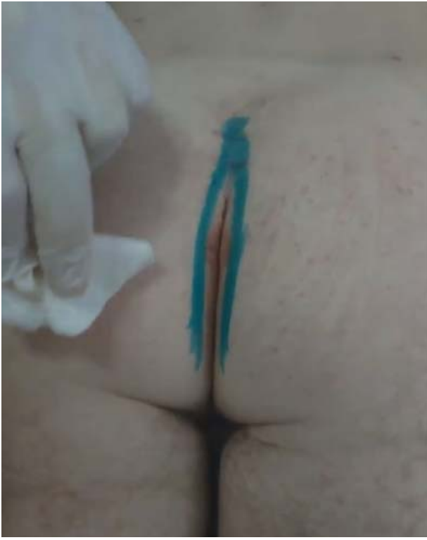
Figure 3. Marking of the lateral line of the intergluteal cleft using a dye