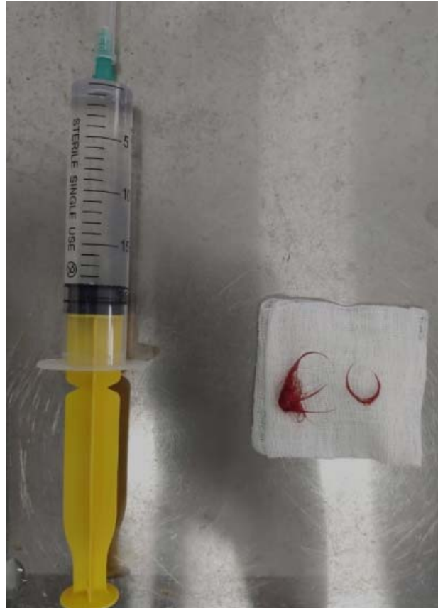
Figure 10. Extracted hair from the pilonidal canal

Steps | Inject a small amount of a dye under pressure into the fistula opening with a syringe