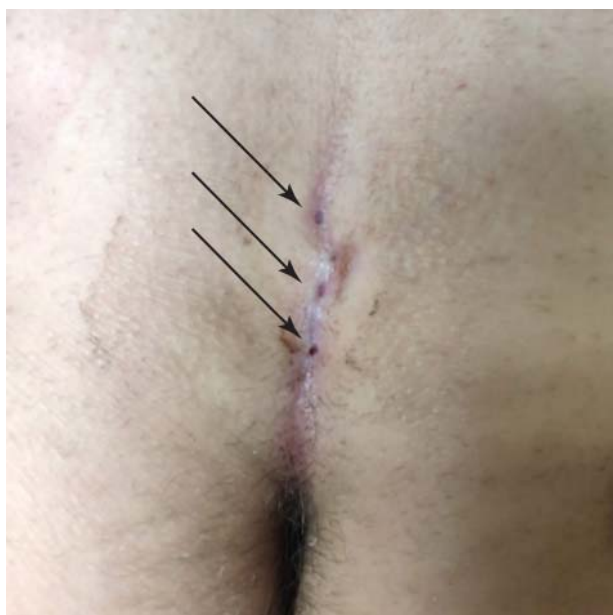
Figure 6. Primary (medial) pilonidal fistula openings (indicated by arrows)