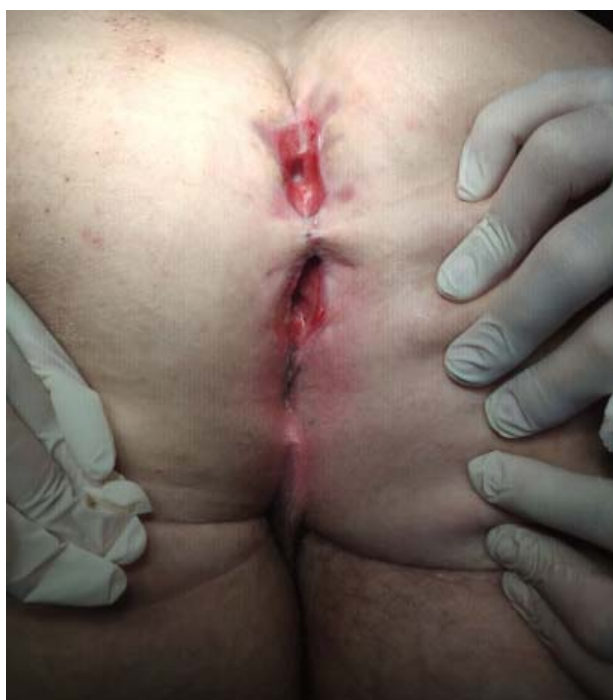
Figure 7. Recurrent pilonidal cysts in the form of weakly granulating wounds. The lower wound has a transition to the upper edge of the anal canal involving the sphincter apparatus of the anus

determine their nature (size, presence of hair shafts, distance from the intergluteal cleft, presence/absence of secretions, presence/absence of signs of inflammation, ipsilateral/bilateral spread;