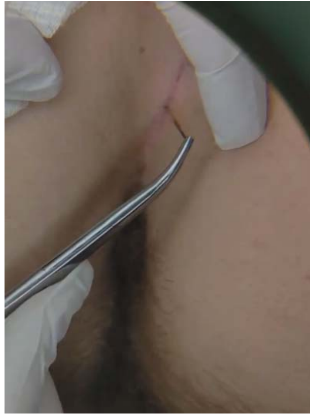
Figure 9. Hair extraction from the pilonidal canal

anal canal or more distal parts of the rectum, first of all, perianal fistulas or abscesses.